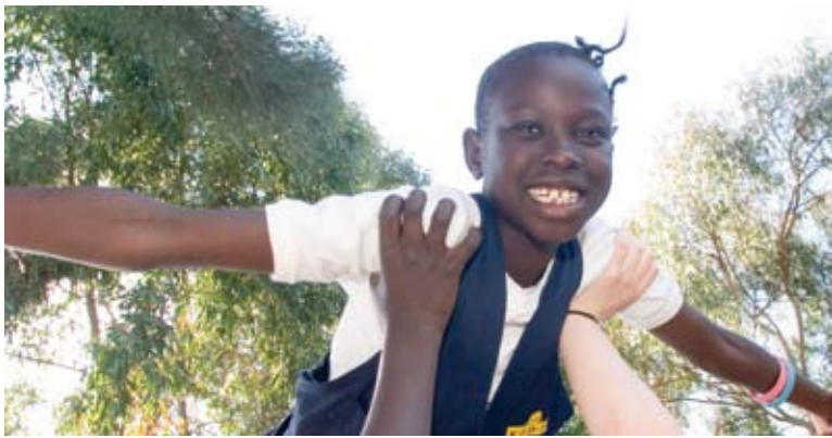
Flying high – VicHealth funds innovative projects that plant the seeds of change