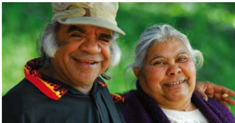
Image from Pitcha This, a VicHealth funded project, which used film, photography and digital storytelling to promote positive images of six Victorian Indigenous communities;