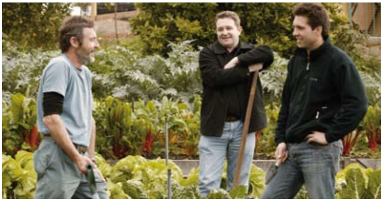
By growing some of their own food, individuals and families have access to fresh, nutritious food, and because gardening involves physical activity, it promotes physical fitness and health.