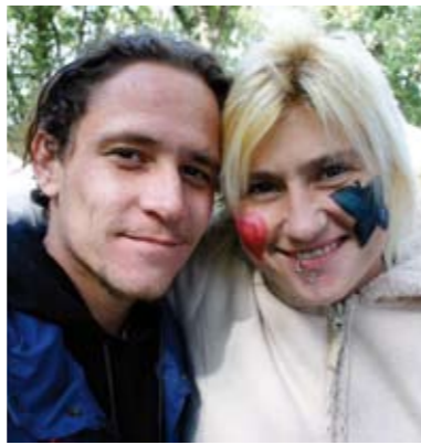
Social networks can provide support, opportunities for engagement and meaningful social roles, as well as access to resources and intimate one-on-one contact.