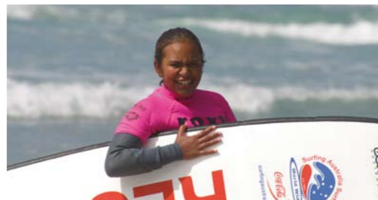
Learn-to-surf classes are conducted by the Victorian Indigenous Surfing Program for Koori kids who otherwise have little opportunity to participate recreationally or competitively.

Invitations to speak at interstate and national conferences on healthy urban environments have also led to an increased awareness of health and wellbeing issues contributing to broader outcomes. In July 2005 the Victorian government released Safer Design Guidelines, including sections on health, active transport and walkability. In 2006 the national PIA released a position statement on Planning for Healthy Communities. In addition, the PIA used the Victorian example to seek federal support and funding for a national rollout of a similar program. Research partnerships have also been established with Deakin University, Melbourne University, RMIT and planning consultants.